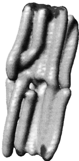
Fig. 2. Molecular model of a bilayer composed by fatty acids and n -alkanes showing a molecular arrangement stabilized by hydrophobic interactions between the hydrocarbon tails of both types of molecules. The picture shows the van der Waals surface of this arrangement formed by monomer constituents of the translucent lamellae. The model takes into account a high molecular packing of the fatty acids and n -alkanes. The polar functional groups (carboxylic acid groups) are just located at the top and bottom (darker zones) of the bilayer. Mean theoretical thickness of this bilayer is 4.9 nm. Molecular modellization was obtained by standard molecular dynamics calculations using the HyperChem program (HyperCube Inc., Ontario, Canada).

As it has been indicated above, after cutin depolymerization by saponification, polysaccharide and phenolic material were removed using anhydrous hydrogen fluoride and acidolysis procedure, respectively. The resultant residue was refluxed in tetrahydrofuran for 48 hours. This reflux allowed the extraction of the waxy components that are major constituents of the white lines. In isolated cuticles of Clivia miniata leaves, the main constituents identified were fatty acids and n -alkanes. The major fatty acids found were hexadecanoic (12.6%) and octadecanoic (9.1%) acids and small amounts of cis 9-octadecenoic acids (9.4%). In addition, n -alkanes contribute significantly to the total composition (41%). These n -alkanes range